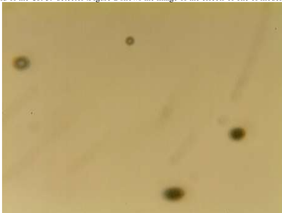
Figure 1 -show the effects of one of the soil samples under study

After calculating the number of traces left by the interaction between the alpha particles (emitted from radon) and the detector surface facing the samples we calculated the radiation background of the CR-39 detector, In the same period that the detectors used were exposed to samples, one of the detectors was placed in a sealed and sample-free tube. The purpose of this was to compute the radiation background of the CR-39 detector. Figure-2 shows the image of the effects of one of model.