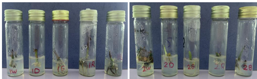
Figure 2: Root growth of Rosa invitro under different light quality (1: Rosa damascena , 2: Rosa hybrida ) – (W: white, D: dark, G: green, R: red, and B: blue light)