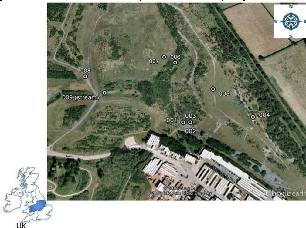
Figure 1 -satellite image of the study area showing sampling sites

obtain a <2 mm fraction. A portion of each sample was finely ground using an agate ball mill (Retsch, Model PM400), and then stored in polyethylene bags in preparation for elemental analysis. Water samples were immediately filtered through 0.45 \mu\text{m} cellulose acetate syringe filters into acidified polyethylene bottles and stored at ambient temperature until laboratory analysis.