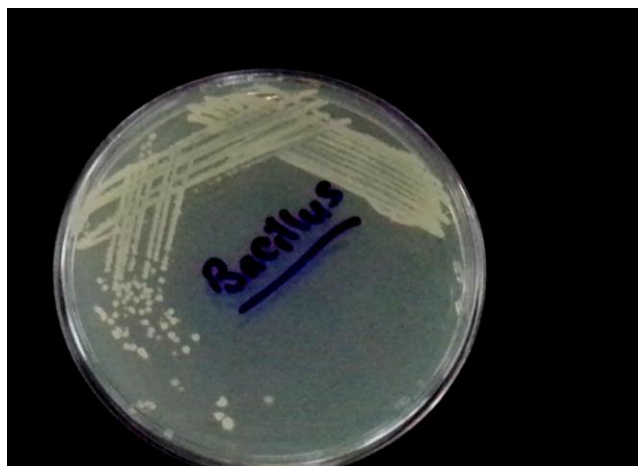
Figure 2 - Bacillus subtilis growth on nutrient agar medium bacterial appeared after 1 day of incubation at 37°C.

Upon microscopic examination, it was observed that the bacterial was bacilli Gram-positive, forming Endospore.