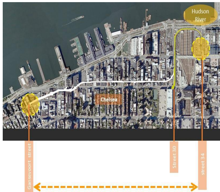
Figure 2-High line path[13]

has become one of New York City's major tourist attractions, attracting more than six million visitors a year as a result of the development of commercial and residential properties and is the key driver for the revival of Chelsea's neighborhoods and a platform for viewing interesting architecture and designs. The railway was built in 1943 to protect goods from the western road sectors where trains pass through the third floor between the buildings to reach food and agricultural goods to the west side of Manhattan until 1980.