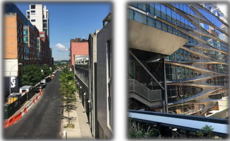
Figure 4- intensify building around high line/Authors.

In 1996, the Seattle Museum of Art decided to build an urban space to display sculptures in the city center. The chosen site was an 8.5-acre industrial area (oil industry and storage) that extends more than forty feet from the street level to the sea edge, the efficient railways and the main road have been restored as an effective environmental system. The pollution has been treated in addition to creating new sustainable forms, the nurturing of local farms and the development of part of the coast.