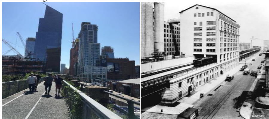
Figure 3-modernize bukding

Re-zoning, which occurred with the decision to maintain the railway, has helped to provide support from developers who have a stake in the land within the project, but is also the key to opening the development potential of the region ,In 2005 the city adopted a proposal for re-zoning, which enabled the development of new residential and commercial buildings along the railway, which allowed for the intensification of buildings around the railroad.