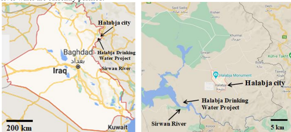
Figure 1- Map of the study sites, Halabja city, 2019. Samples were collected from both Halabja Drinking Water project and Halabja city cites.

The study was performed on the Halabja drinking water and Sirwan river water, located in Halabja city, Kurdistan region of Iraq. It is located 240 km north-east of the capital Baghdad and 14 km from the Iranian border. Geographically, the city is located between 35°11'11"N latitudes, 45°58'26"E longitude, and 900 m elevation above sea level. The population of the city is estimated to be 247,000. They fundamentally depend upon three sources of drinking water, which are Halabja drinking water, Water fall Ahmad Awa, and wells. Halabja drinking water provides approximately 75% of drinking water for the Halabja province. The water source of the Halabja drinking water is Sirwan River. This river is located in the south-west of Halabja city, 12 km from the city center (Figure 1). Approximately 25,000 m 3 /day of Sirwan river water are currently purified.