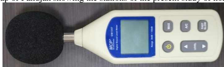
Figure 2- Auto range RS-232 sound measuring device used in the present study.