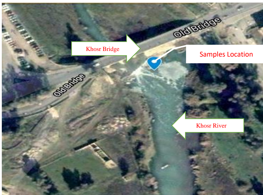
Figure: 1-The satellite picture of samples location

Khosr is a tributary river that rises in Shikhan suburb and runs through Mosul city. It is used for drainage of sewage water from houses and industrial buildings along the river (Figure-1). Samples were collected by using sterile flasks from the end of Khosr river, before meeting the Tigris river, in the end of November (24 °C water temperature). Wastewater samples were analysed for the presence of fungal new strains by using the plates dilution method. A volume of 1 ml from each sample was added to a plate and then the Potato Dextrose Agar (PDA) medium with chloramphenicol (0.05g/L) were decanted on it after cooling to 45 ° C. Then, the plates were incubated for 5 days in 28 \pm 2 °C [6].