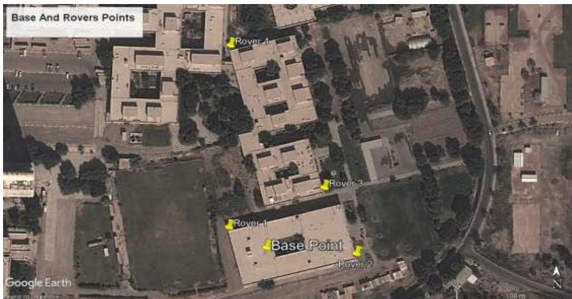
Figure 2- A Satellite Image for Base & Rover Points Locations.

The Topcon Hyper-II receivers collect the position of rover point as (Lat. Long. decimal degree), and the height above the sea level, m in each measurements day, the weathering parameters were collected in this region on that day systematically. The data were rearranged according to the station position. The Base coordinate was pickup through a duration of 3 hours in order to achieve high accuracy at 2-11-2016 Above Computer Department, Baghdad university camp. After 36 hours the base coordinates value has been corrected using the OPUS. These coordinates values are constant for all positions, i.e. the highest of Base receiver and its projection to the ground was denoted, so this position was used for all Rover task. Table-2 represent the data of base point, where, Table-3 show