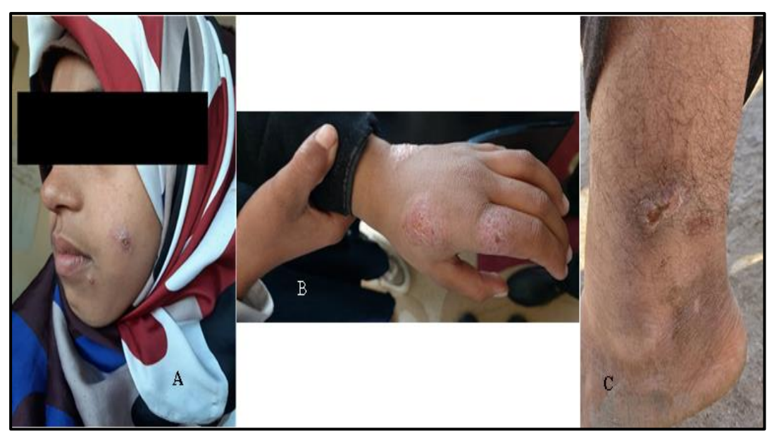
Figure 2- Cutaneous lesions of Leishmania appearing on different locations of the body. The samples were collected from Al-Shureifat village, Babylon, Iraq in 2020; A. Face, B. Hand, C. Leg.

About 82 (57.9%) of the recorded CL cases appeared as new cases, but 60 cases (42.1%) of were recorded as a relapse after treatment (Table-8). These results are similar to those reported by an earlier study [30], which found relapsing lesions after ten months, which required further treatment. The highest number of sores recorded was two sores in 45 cases (31.6%), while the lowest number of sores was four sores recorded in 7 cases (5.2%) (Table-9). The results agree with those of other studies which discussed the long periods of exposure to repeated and consecutive bites of sandflies as well as the high population density of sandflies in this area [29, 31]. In general, the presence and distribution of lesions depend on which parts of the body are exposed and the susceptibility of the host [11].