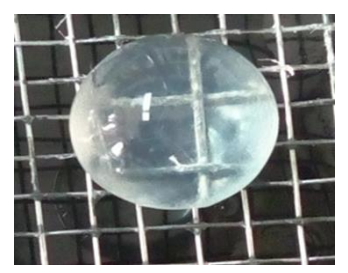
Figure 1a. Lens representing the normal control group

In this study, cataract was induced by incubating lenses in culture media containing high glucose (55mM); this occasioned the formation of superoxide radicals and H_2O_2 leading to oxidative stress [26]. Lens opacification in the control group was visible at 48th hour after incubation. Figure-1a shows a representative of the normal lens incubated with artificial aqueous humor, where the lenses were clear and void of opacity. Figure-1b exemplifies the cataract control lenses incubated with artificial aqueous humor and glucose (55 mM). The lenses showed extensive opacification after incubation. Figure-1c represents the drug control group; the lenses were incubated with artificial aqueous humor, 55mM glucose and standard drug. The physical evaluation showed normal transparent lenses. Figures-1d, 1e, 1f, 1g, and 1h represent the groups treated with 250 µg/ml crude extract of C. aconitifolius , n-hexane, dichloromethane, ethyl acetate, and aqueous fractions, respectively. The physical evaluation of these groups indicates varying effects of the crude extracts and fractions on cataract lenses. Table-5 summarizes the results from the photographic evaluation and indicates the extent the crude extract and fractions of C. aconitifolius had on ameliorating cataract induced on lenses by exhibiting reduction in the opacity of the lenses.