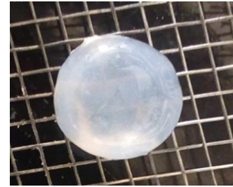
Figure 1b. Lens representing the cataract control group