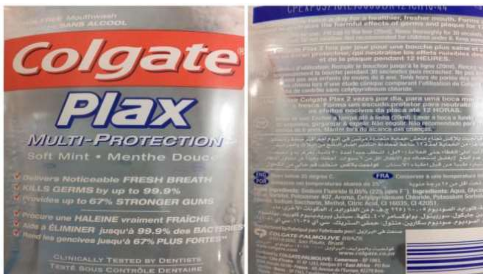
Figure 2-Colgate label