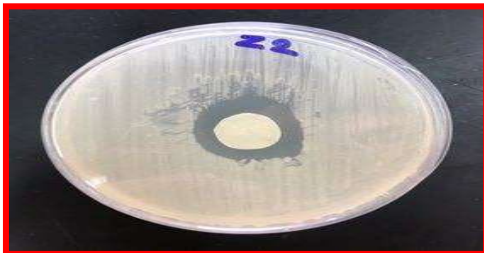
Figure 7- The inhibition zone of ZAK against Staphylococcus lentus growth on Muller-Hinton agar