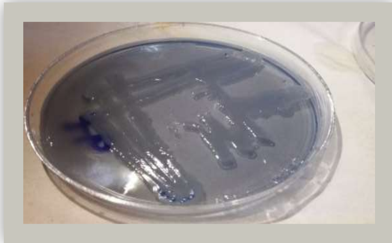
Figure 5- Staphylococcus lentus growth on Mitis Salivarius agar