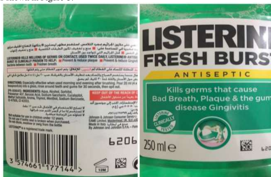
Figure 1-Listerine label