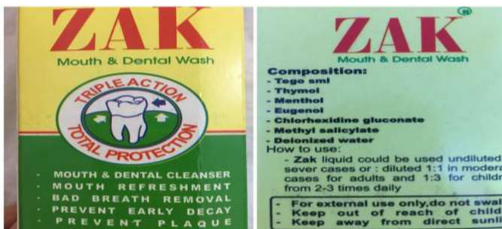
Figure 3-ZAK label