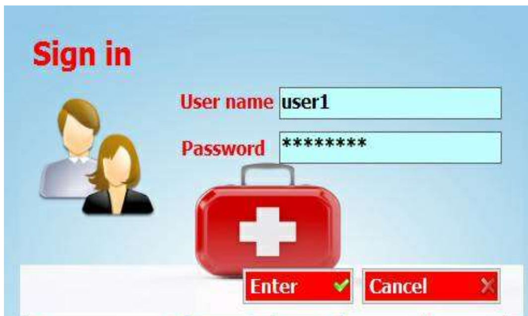
Figure 4 - Authentication window to enter to the FADSS application

Figure-4 demonstrates the login page to enter emergency case data. The user can enter secret key and a user name (username: user1 and password: admin) as a default value, and can change it.