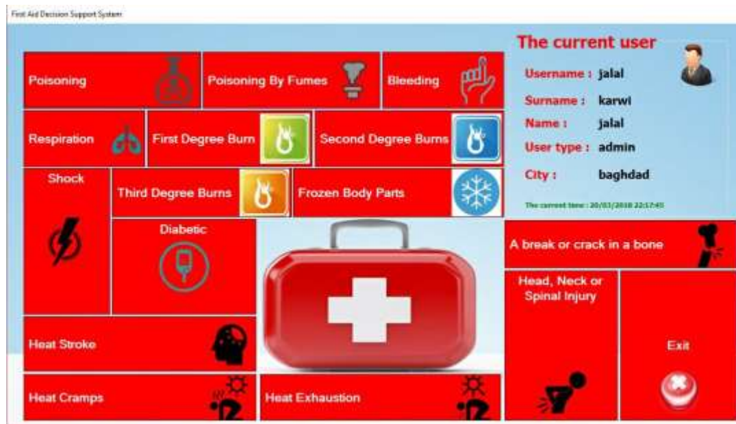
Figure 5- First window to show the emergency cases in the FADSS application.

the application. When used to question an instance of any dangerous circumstance, the instrument raises a table demonstrating the model outcomes and the information for the chosen first aid case. There are fifteen important first aid critical situations that should be having immediate actions to save lives of people. The data investigation and displaying restorative can be recovered through DBMS (MySQL) in order to demonstrate the real treatment. In other words, it is provided as an input for analyzing the medical model to acquire real advices and advantages of the unmistakable practices for evading death. Moreover, a simulation record descent service was provided to the medical centre to provide a relative examination of various conceivable arranging techniques to accomplish an ideal arrangement.