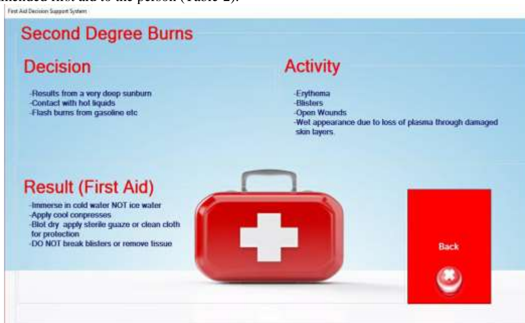
Figure 7- An example of emergency case (second degree burns)

Figure-7 demonstrates the emergency case (Second Degree burns) in the First Aid application. From this part, we can obtain the information about the Second Degree burns case, starting with the symptoms, then decision making (diagnosis as a Second Degree burn), and finally providing the recommended first aid to the person (Table-2).