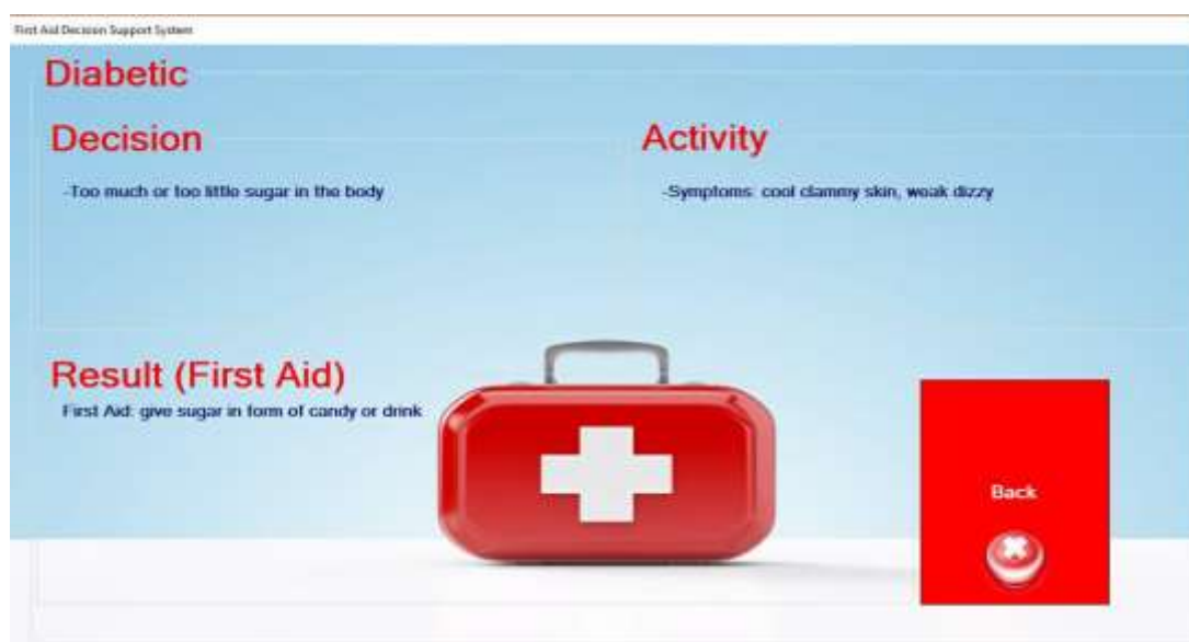
Figure 6- An example of emergency case (should take an action of first aid)

Figure-6 demonstrates the emergency case (Diabetic) in the First Aid application. From there, the user can find information about diabetic cases, starting with the symptoms (cool clammy and weak dizzy), then decision making, and finally providing the recommended first aid (give sugar in a form of candy or drink) as shown in Table-2.