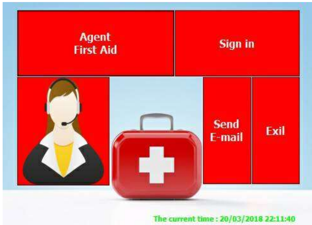
Figure 3- Primary window of the application (FADSS).

Figure-4 demonstrates the login page to enter emergency case data. The user can enter secret key and a user name (username: user1 and password: admin) as a default value, and can change it.