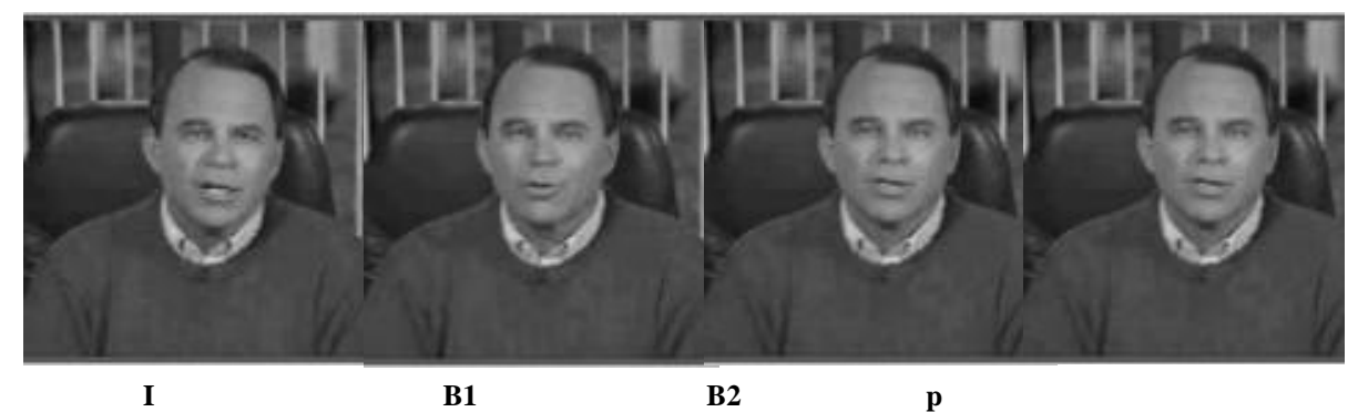
Figure 6- Frames (I), (B1),(B2) and (P) respectively Where BB-pictures are bidirectional predicted both from the previous decoded (I) and P-picture.