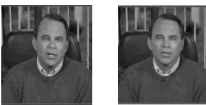
Figure 3- The origin (Man) image(I),(P).