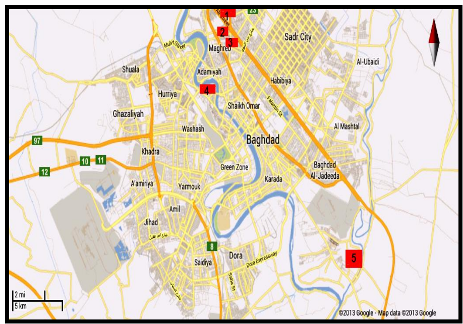
Figure 1- Map of Baghdad city