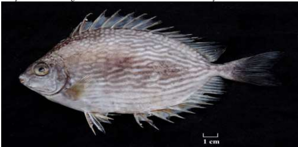
Figure 2- Siganus javus from the Iraqi marine waters.

Total length of the specimen was 183 mm, standard length was 138 mm. Body deep, 54.01% in standard length and compressed, 14.52%. Snout short, 11.31%. Head length was 28.99%. Dorsal fin length was 70.91% and its dorsal profile slightly concave above the orbit. Pelvic fin length was 19.97%. Caudal peduncle depth was 7.27%. Dorsal fin with 13 spines followed by 10 rays, fourth to sixth dorsal-fin spine longest. The anal fin had seven spines followed by nine rays, all anal fin spines of similar length and subequal to or slightly shorter than longest anal fin spine. Pelvic fin with two strong spines and three soft rays between them. The total gill rakers were 19. The color of the specimen was back dark bronze, to paler below, numerous metal blue spots on the head and upper sides, silvery blue undulating lines on mid and lower sides of the body.