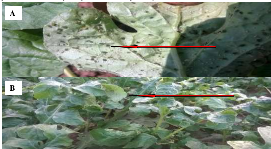
Figure 2- A. Aphis gossypii on abaxial surface of watermelon leaf; B. Leaf curling caused by sap-sucking insects