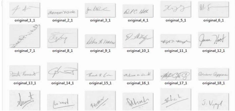
Figure 2 - samples of different datasets

and 30 signature forgery and the last dataset consist of 50 signatures original and 50 signature forgery . the first and the second dataset is English signature and the third one is collected from people it is contained Arabic and English signature . The figure 2 shows some sample of datasets.